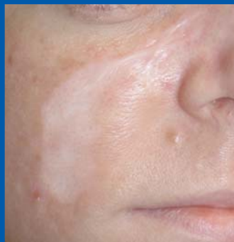
Full thickness wound after two Omnilux plus treatments