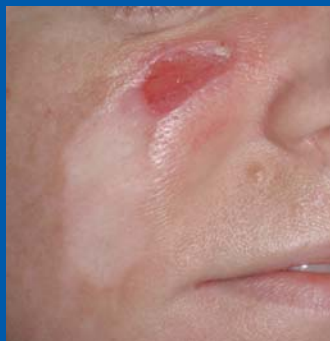
Full thickness wound at 90 days