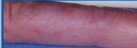
Bowen's disease after ALA-PDT Tx