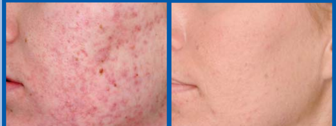
Severe inflammatory acne before Tx After three treatments with photodynamic therapy with 5-aminolevulinic acid using the 633 nm (red) Omnilux revive for activation